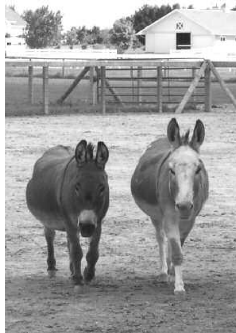
No matter where you find Blackfoot and Royal, you always find them together. When you call their names, their ears prick up!

Before awakening Blackfoot, they brought Royal back into the operating room. For the last several months, Royal has been with Blackfoot. During the first month of bandaging Blackfoot’s leg, he had to be blindfolded because he got so upset. Royal