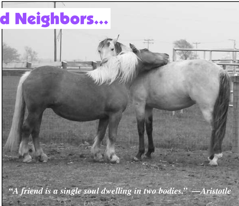
“A friend is a single soul dwelling in two bodies.” —Aristotle

Y eah for Spring! Everything is waking up (including me). It is time to get out and share the sunshine and spring breezes with friends. This morning we opened the gates and watched the horses run in the pastures, hopping and tossing their heads with their friends. They run in groups together. The brothers Ike and Mike with leader Midnight see how fast they can run. The two appaloosa “adolescents” Louie and Diamond see how high they can jump. Marcus and Buddy play-chase Lilly along the fence line, since Lilly is young Marcus’s mother and Buddy’s friend from his childhood farm. They separate and then come together in play, eventually settling down to some tender new grass. They are all so aware of one another. Each herd is separated by fences and has its own personality, much like classrooms in an elementary